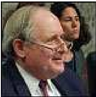
Senator Carl Levin (D), MI, during Enron Hearings.