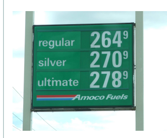
Gas prices soared in the Upper Peninsula; an area dependent on tourism and long distance shipping.