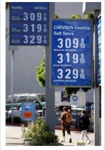
Nationally, the Oil Freak Show is enraging people.

Interestingly enough, NBC It is no secret that oil comreports that oil prices are up because of power outages at refineries and a huge increase in auto sales which predicts a 2% increase in oil usage. The sum of the total doesn't add up.