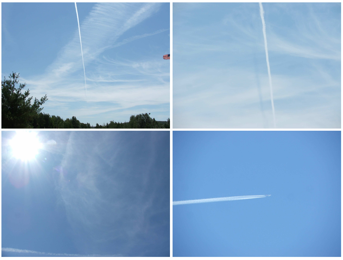
Informational Link: <u>http://www.willthomas.net/Convergence/Weekly/Chemtrails.htm</u>

Barium is a metallic element, soft, and when pure is silvery white like lead; it belongs to the alkaline earth group, resembling calcium chemically. The metal oxidizes very easily and should be kept under petroleum or other suitable oxygen-free liquids to exclude air. It is decomposed by water or alcohol. The impure sulfide phosphoresces after exposure to the light. All barium compounds that are water or acid soluble are poisonous.