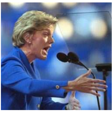
Governor Granholm-She could have been the Poster Child Against Women's Suffrage.

The Creationists have to unite and send a clear message during the Primary. Unfortunately, the Democrats don't trust the voters in choosing a candidate in any type of Primary election; like good little liberals, they'll simply be told who to unite behind by those wealthy and important enough to be invited to their state caucuses. Granholm, Prusi and Stupak will remain the cream of their crop, while others have to make tough decisions.