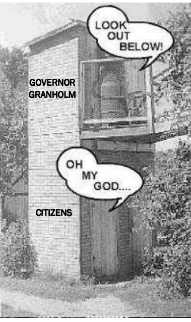
Governor Granholm (D), Michigan: A Canadian-born Liberal Commie?

Three casinos were opened in downtown Detroit, but the State revenue still keeps dribbling in and Detroit still spends on things that apparently have no tangible identifiers. The State's budget is nearly equal to $4,500 for every man, woman and child.