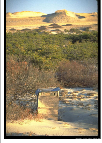
In the wilderness, one does not look for the comfort of an indoor sitter; one merely drops trousers, squats, and thrusts.

"We've got a lot of work cut out for us to reach $78 million, but we know that Michiganians care about our state's natural resources and will come for-