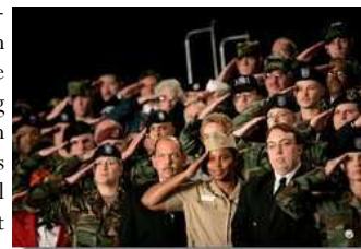
President Bush receives the respectful salute due him by American Veterans. Tobyhanna Army Depot Tobyhanna, Pennsylvania 11-11-05

Only those struggles at home with the liberals cause indigestion among our fighting men and women. It is the lack of will displayed by the left and the very willingness to retreat, vacate and hang-out to dry an entire nation. Their idealisms have had a major impact on both those with guts enough to serve and those with guts enough to consider enlisting to serve a higher calling.