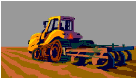
Michigan Ag News Headlines