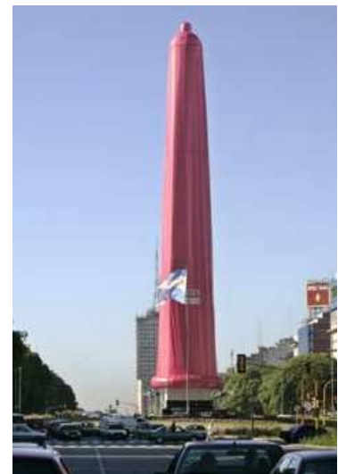
The Obelisk of Buenos Aires is covered with a giant condom to commemorate World AIDS Day December 1, 2005. According to a report issued by ONUSIDA (UN AIDS), the number of people infected with the HIV virus in Latin America had risen over the last year from 1.6 to 1.8 million.

With financial and technical assistance from NRCS, farmers, ranchers and other landowners will continue to address resource concerns on agricultural working lands, promote environmental quality, address challenges in water quality and quantity, protect prime farmland and grazing lands and protect valuable wetlands ecosystems and wildlife habitat.