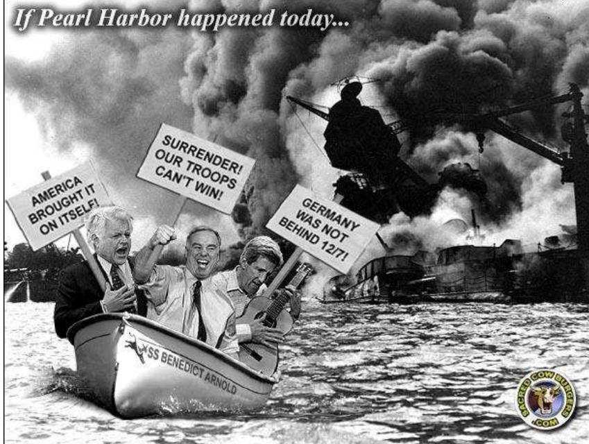
Yooper Scooper Home Page: <a href="http://www.hafeman.com/patriots.yoopscoop.com/">http://www.hafeman.com/patriots.yoopscoop.com/</a>