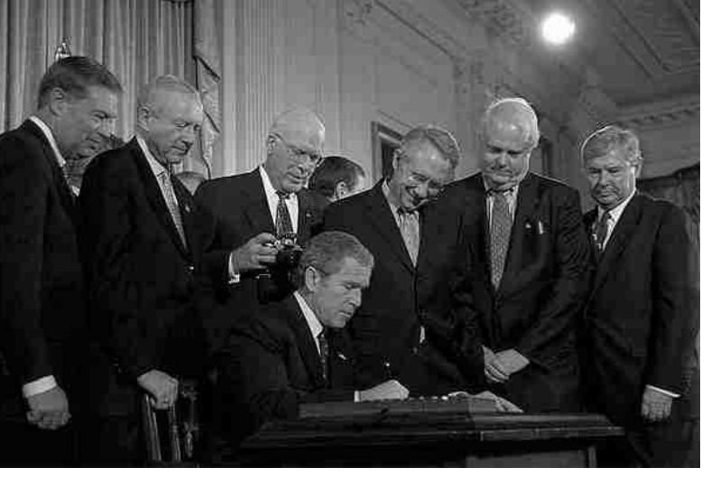
President Bush Signs the Patriot Act-After four years to make corrections and ensure rights are protected, Congress now needs three months to do what they should have done over time.