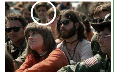
John Kerry sitting behind Jane Fonda during an anti-war rally at Valley Forge, PA in September 1970.

Editor's note: It's evident that Jane Fonda is desperate to be recognized as a formidable anti-war advocate. The unfortunate love-fest by the media of the dumb-one.