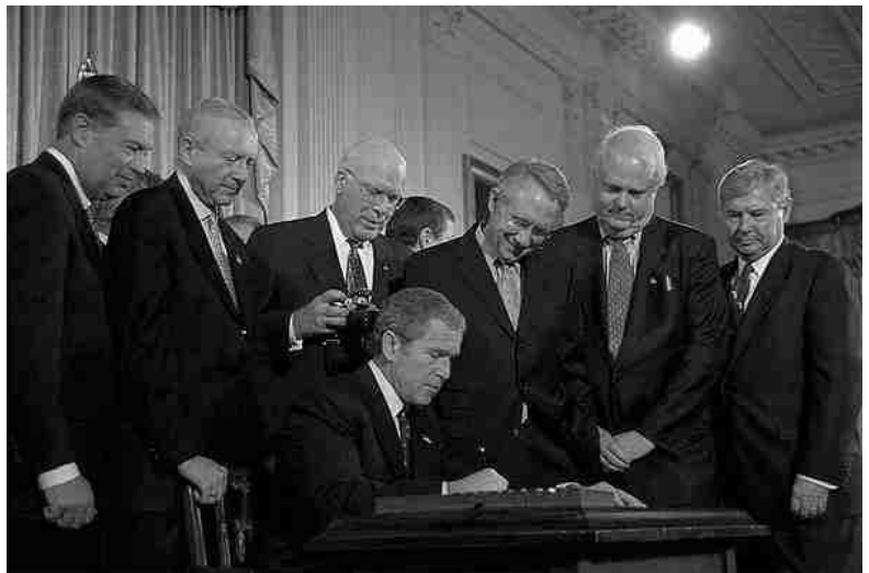
President Bush Signs the Patriot Act—After four years to make corrections and ensure rights are protected, Congress now needs three months to do what they should have done over time.