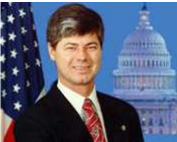
Bart Stupak (D—Menominee)

http://clerk.house.gov/evs/2005/roll661.xml - http://clerk.house.gov/cgi-bin/lgwww_bill.pl?204437 — http://www.cbo.gov/ftpdocs/69xx/doc6954/hr4437.pdf http://thomas.loc.gov/cgi-bin/bdquery/z?d109:HR04437 — http://thomas.loc.gov/cgi-bin/cpquery/R?cp109:FLD010:@1(hr350) http://www.senate.gov/legislative/LIS/roll_call_lists/vote_menu_104_2.htm — http://clerk.house.gov/evs/2005/index.asp