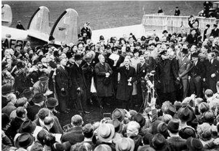
Neville Chamberlain holding the paper containing the resolution to commit to peaceful methods signed by both Hitler and himself on his return from Munich. He is showing the piece of paper to a crowd at Heston Aerodrome on 30 September 1938.