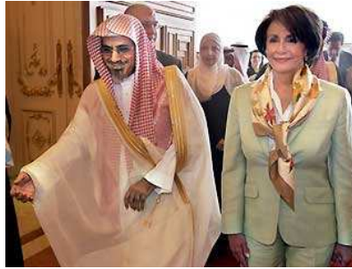
WASHINGTON— An apparently botched message during a widely discouraged visit by House Speaker Nancy Pelosi to Syria this week (April 2007) has U.S. officials criticizing rogue efforts at diplomacy among U.S. politicians.

It certainly appears the 21st Century is running parallel to the 20th Century, in particular 1938. As the left-wing stumbles over itself in competition to determine who is in the most denial, plans are being formulated among evil people to overthrow citizens in various nations all over the world, which includes the United States and Israel. The liberals are known for not only promoting the destruction of their own nations, but for facilitating it as well.