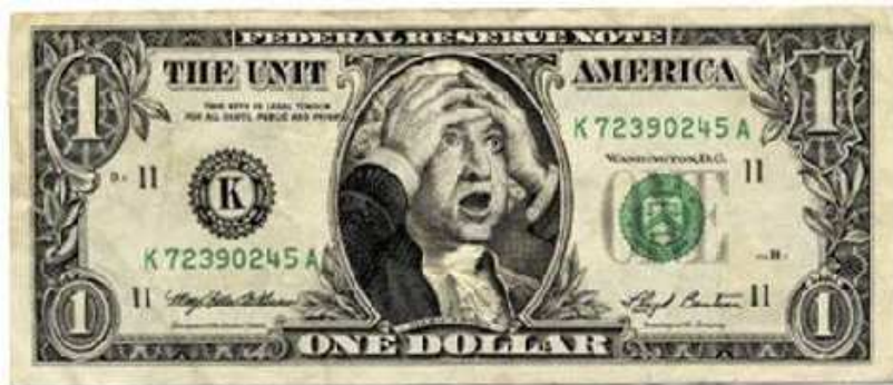
The price of gas is how much?!!

We do not need Socialism in oil. We don't need to as for shortages. We don't need another attack on individual liberties. Please, Mr. Bush, if it comes to your desk, veto this monstrosity. Mr. Stupak, I am sure you mean well, but attacking the free enterprise system is not the best way forward.